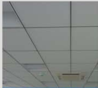
Industrial Falls Ceiling