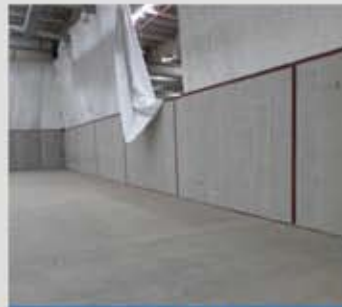
Industrial Length Wall