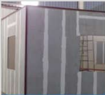
Industrial Office Partition