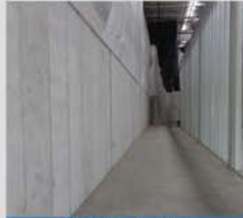
Free Standing Wall