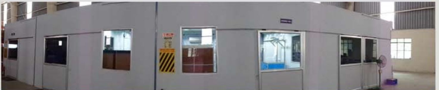
Industrial Office Partition