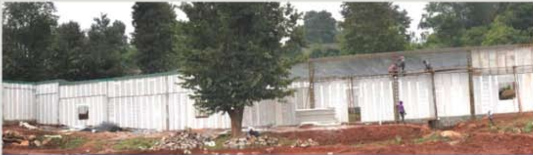
External Prefab Construction