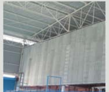
PreFab Wall over Mezzanie Floor