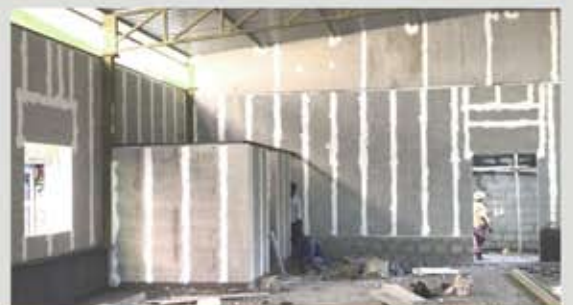
Industrial Prefab Shed Work